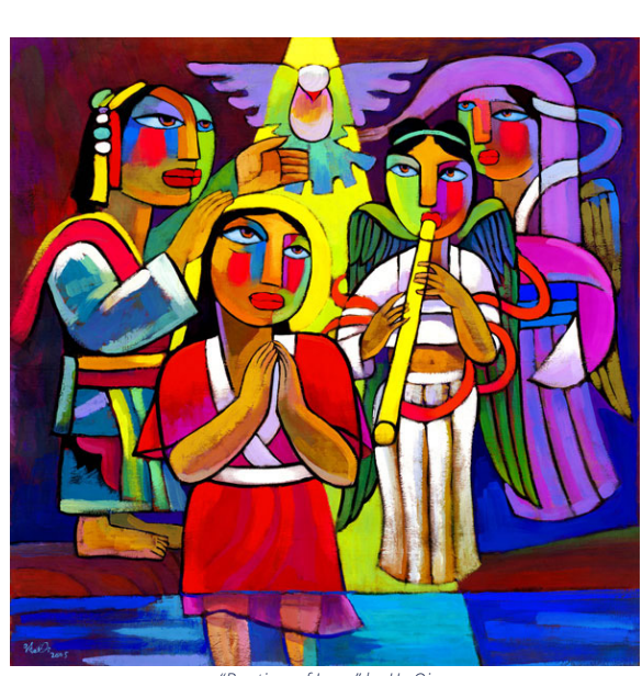
"Baptism of Jesus" by He Qi

Sing it so loud that it drowns out the weariness of the world, for the bravest thing we can ever do is trust that we belong here.