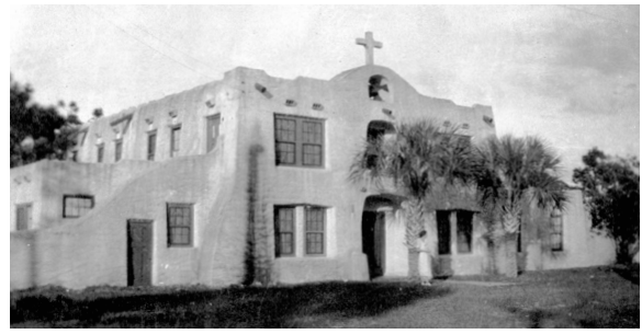
The original Allendale Sanctuary, constructed in 1926, still exists today as the Chapel. (Photo circa 1936)

While Allen Hall and the original parsonage no longer exist, the 98-year-old chapel is still here and currently serves as the worship space for Saint Teresa of Calcutta Catholic Community